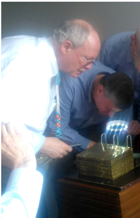
Day on which the Seals were opened and the eight American witnesses were in Brazil to certify the authenticity of the Plates, in accordance with the prophecy described in Doctrine and Covenants 58:13, that the testimony will come from Zion - Jackson County, Missouri .