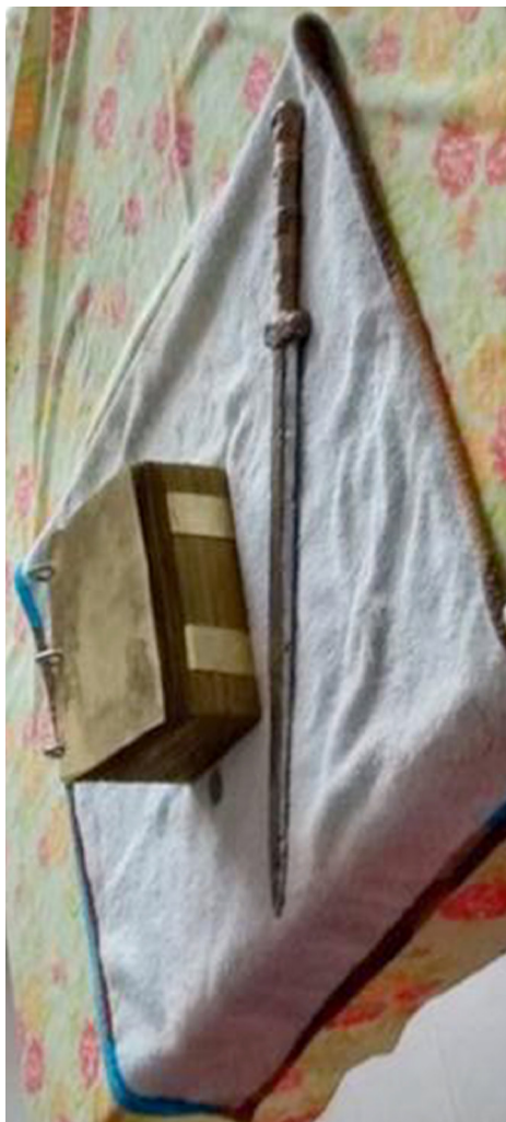
The day the Plates were brought from Mount Agudo, by Maurício A. Berger and the three witnesses.